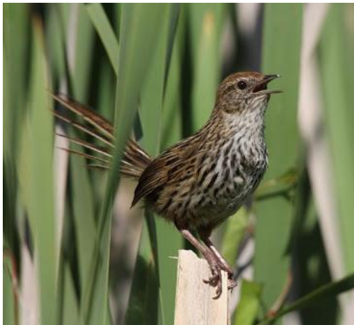
Fernbirds ( At Risk-Declining ) inhabit wetlands and are rarely seen due to their secretive nature.