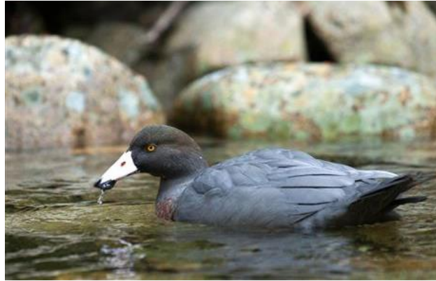
Blue Ducks/Whio ( Threatened-Nationally Vulnerable ) reside in clean, fast flowing streams and are a sign of a healthy waterway. Whio are also found on the $10 note.