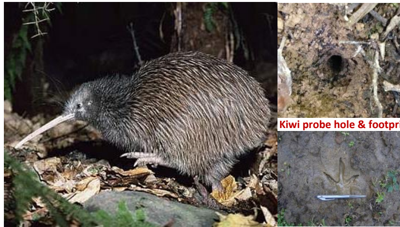
Brown Kiwis ( At Risk-Declining ) have been in our forests, but you are more likely to see probe holes in the ground since they are nocturnal. These holes are a similar shape and size to your finger.