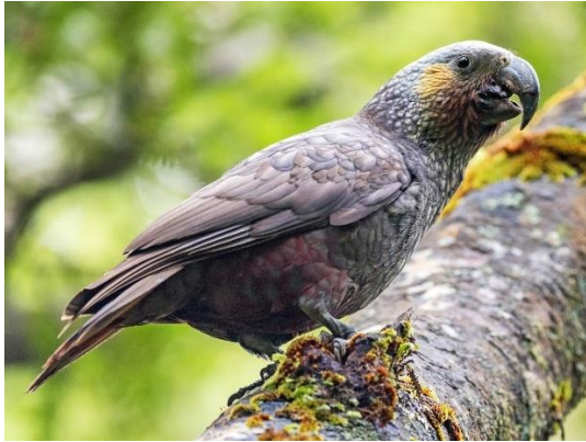
Kaka ( At Risk-Recovering ) are large parrots. They require large areas of forest to survive. Kaka use their strong beak as a 'third leg' to help climb trees and reach food.