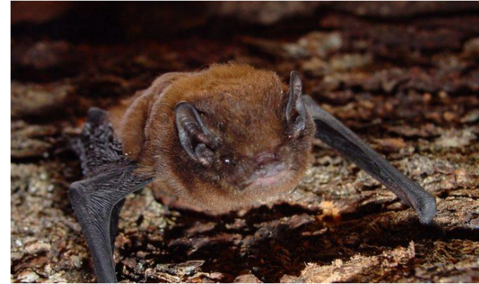
Long-tailed bats ( Threatened-Nationally Critical ) are nocturnal so are more likely to be seen in the evening or early morning when they leave their roosts to come out and feed. They have a very erratic flight pattern, similar to a swallow's.